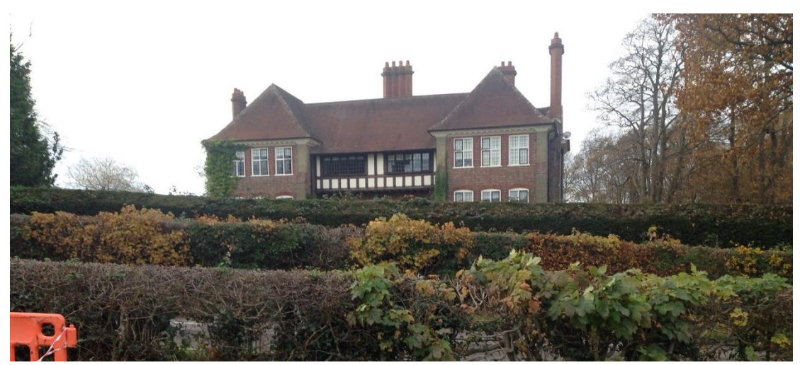
Larger detached house, Burwash Weald