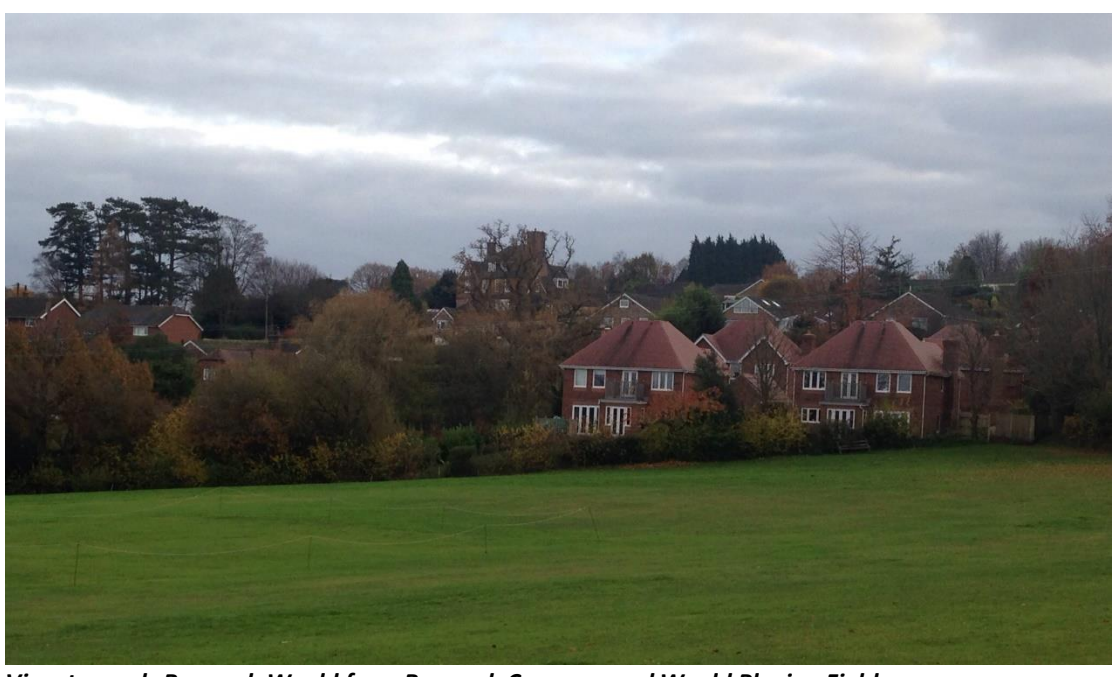
View towards Burwash Weald from Burwash Common and Weald Playing Field