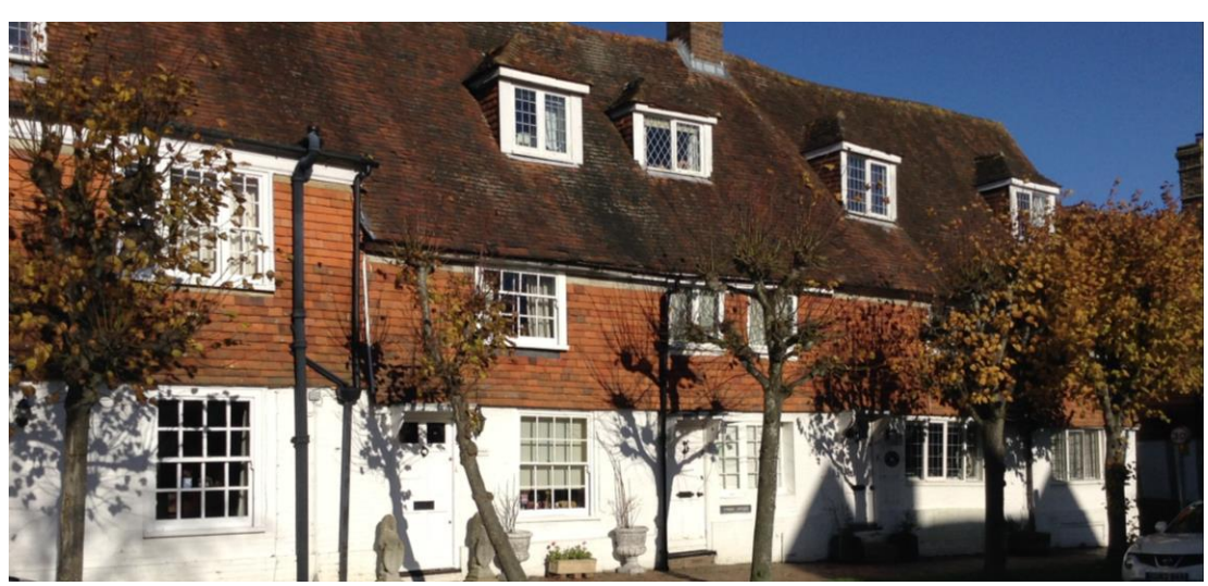
Burwash High Street

The greatest change to the parish in recent times has been the occupations of its inhabitants. The local economy was entirely based on agriculture and local crafts serving the villages and hamlets around. Very few people travelled out of the area. With the growth of the markets in the 14th Century travellers came to the village and over the next 500 years the range of traders and shops increased. But even in Victorian times virtually the whole population worked locally. With the arrival of the railway in Etchingham in 1851 and improved road transport, the population travelled more and commuted to work. Most villagers now work outside the parish or are retired.