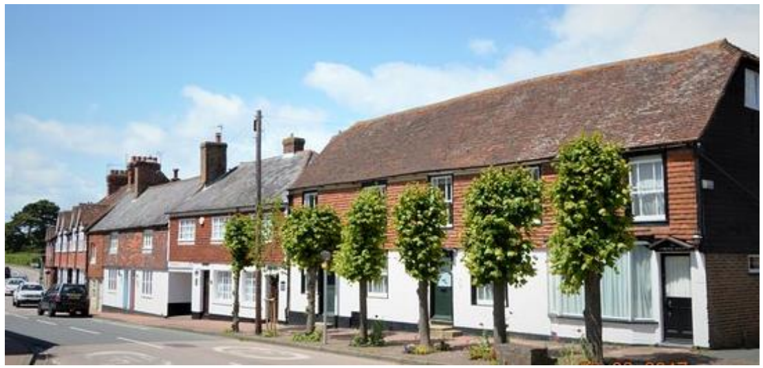
Burwash High Street

Burwash village High Street and School Hill – both within the Conservation Area – make up the historic nucleus of the parish. Both feature distinctive housing – some dating back to the 14<sup>th</sup> century – alongside sympathetic and more recently built properties. The High Street is characterised by its red brick pavements and is lined with lime trees.