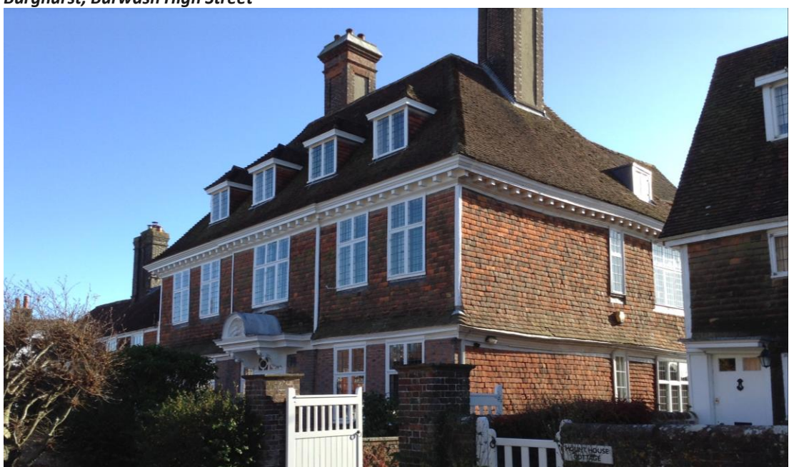
Rampyndene, Burwash High Street