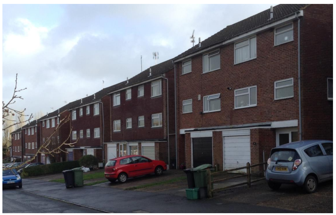
Strand Meadow, Burwash