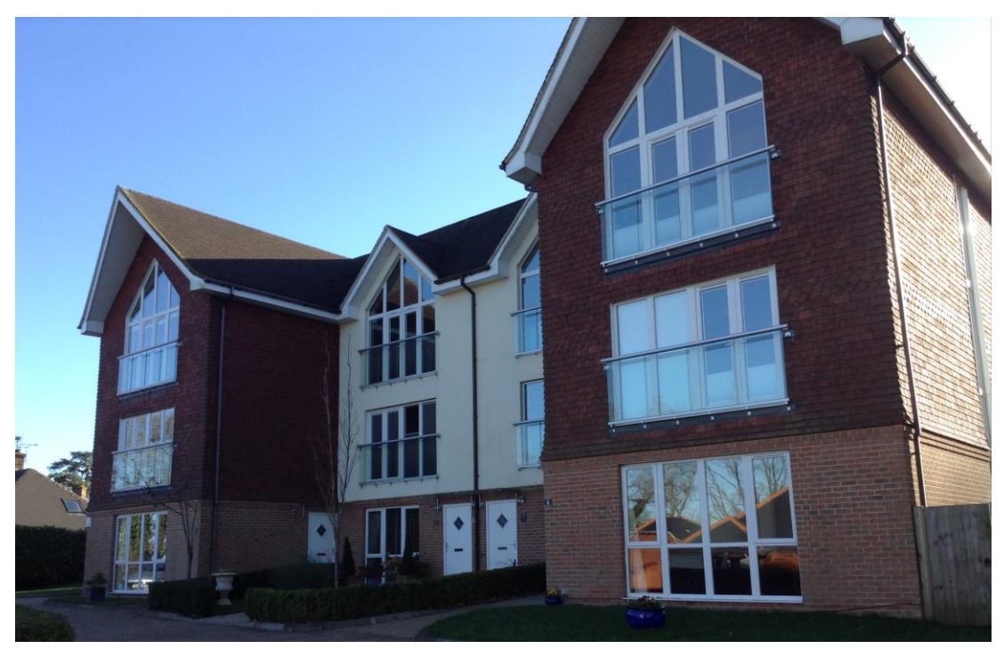
The Old Orchard, Burwash

Rectory Court is a sheltered housing development for older residents in Burwash village High Street owned by Optivo Housing association. It has been empty for some three years pending demolition and redevelopment by Optivo to provide 17 one-bedroom flats and four shared-equity homes. The current absence of provision compounds the lack of affordable housing options for older people.