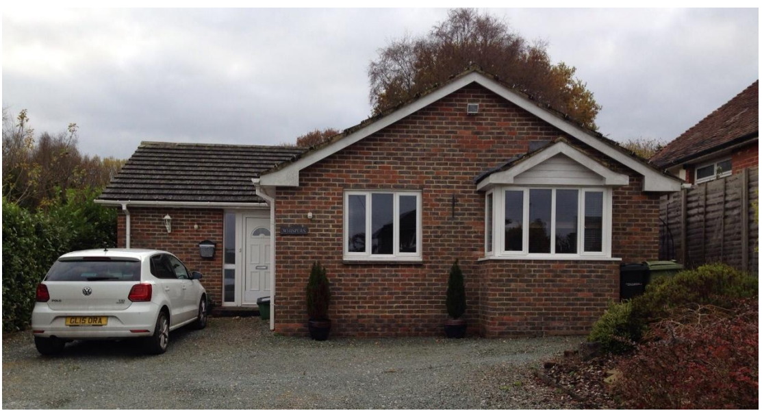
Modern bungalow, Burwash Common