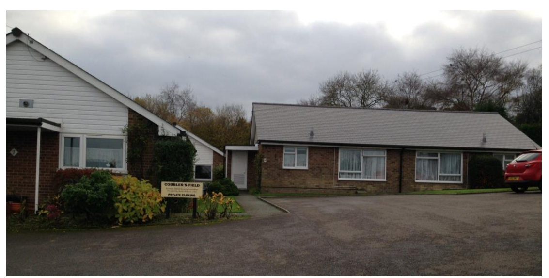
Burwash and District Housing Association units, Cobblers Field, Burwash Common

In Burwash Common and Burwash village, the Burwash and District Housing Association for the Elderly provides 13 one-bedroom units at affordable rents for older residents with a Burwash connection. There is currently a waiting list for properties.