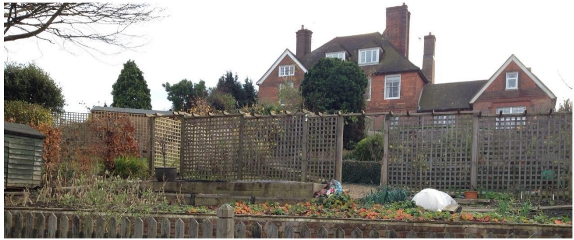
The Old Vicarage, Burwash Common

Building styles range from a former Georgian vicarage and Victorian cottages with slate roofs or weatherboarded fronts to converted oast houses, 1970s bungalows and modern chalet-style refurbishments. Building materials vary but previous developers have avoided any jarring intrusions into the neighbourhood.