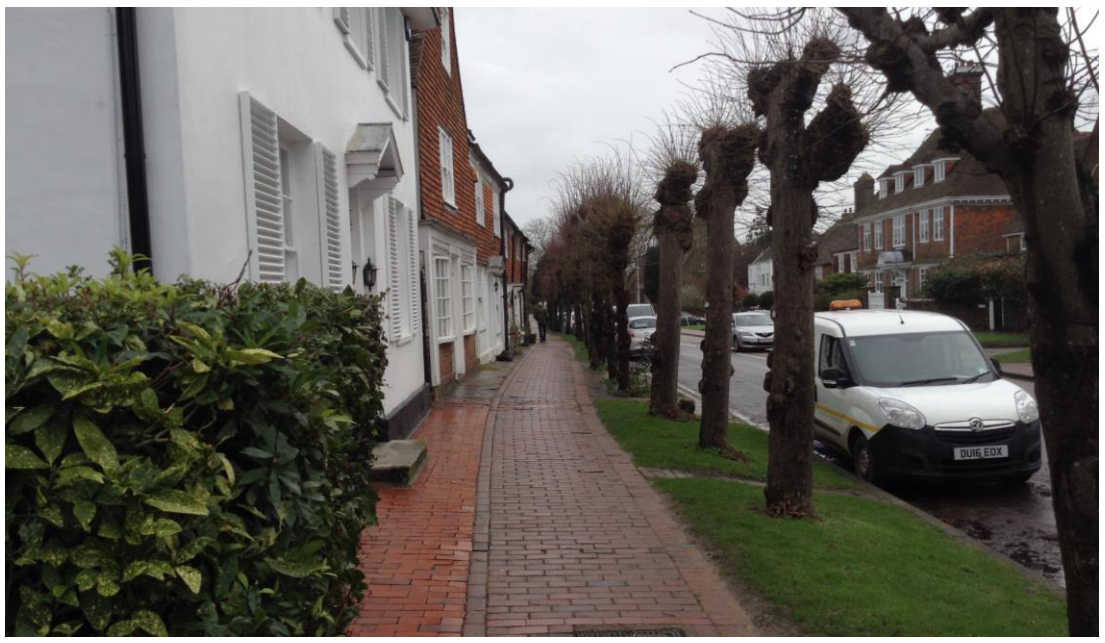
Burwash Village High Street

Brick pavements along both sides of the High Street are an intrinsic element of the aesthetic of the built environment, adding to the appeal of the village.