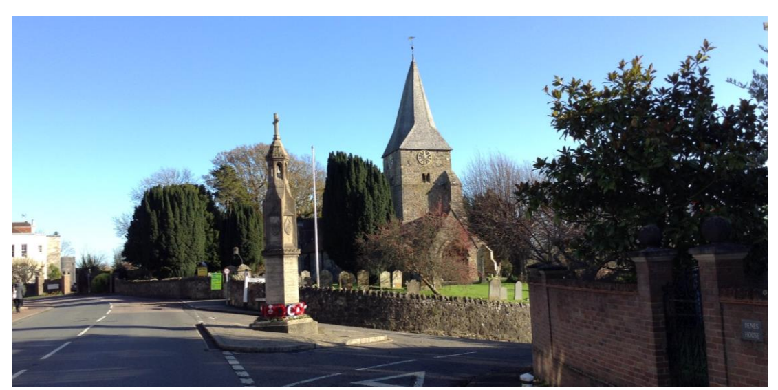
St Bartholomew's Church and Burwash War Memorial

Around 300 men from Burwash fought in the Great War of 1914-18, with 56 being killed. In the 1939-45 war a further 29 men died. All of them are commemorated on the war memorial near St Bartholomew's church. The memorial is a Grade 2* listed building and a key landmark at the historic centre of the village.