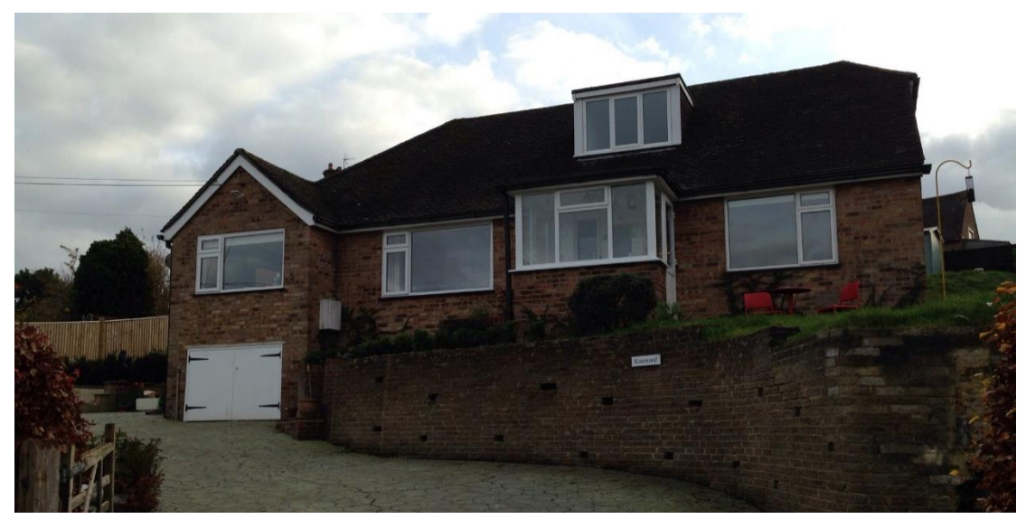
Dormer bungalow in Vicarage Road, Burwash Common