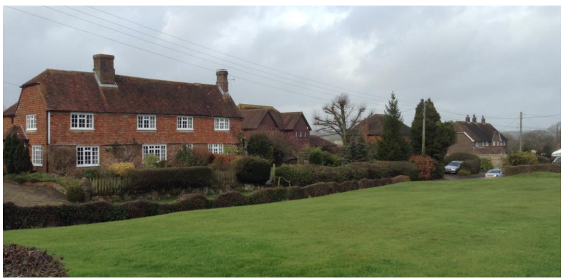
Shrub Lane, Burwash

Shrub Lane, a narrow road running north from the High Street opposite The Old Police House, to the valley of the River Rother, is an eclectic mixture of solid, attractive Edwardian semi-detached homes, modern bungalows, ancient listed properties, farmhouses and 20<sup>th</sup> century individually designed detached properties. All enjoy views across open fields or farmland.