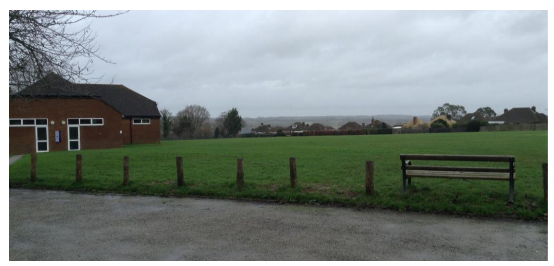
Burwash Pavilion and Playing Fields

Burwash Pavilion sits alongside Burwash playing field and playground, which is managed by a local volunteer group since being acquired with local fundraising in 1962. This popular open space is used by local residents as well as village footballers and cricketers. It hosts the annual fete and the yearly Bonfire Night celebrations. The all-weather tennis courts on the northern perimeter are popular all year.