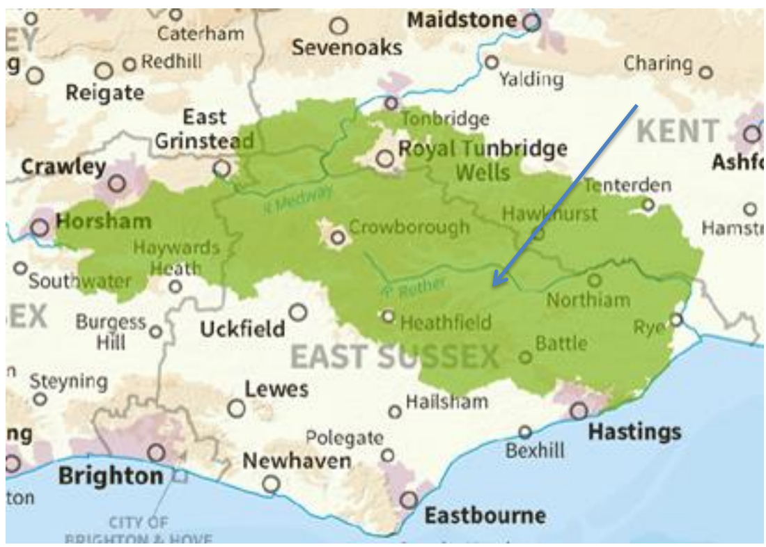
The High Weald Area of Outstanding Natural Beauty

The parish of Burwash is at the heart of the High Weald Area of Outstanding Natural Beauty, about 10 miles south west of Tunbridge Wells and some 15 miles north east of the southern coastal town of Hastings.