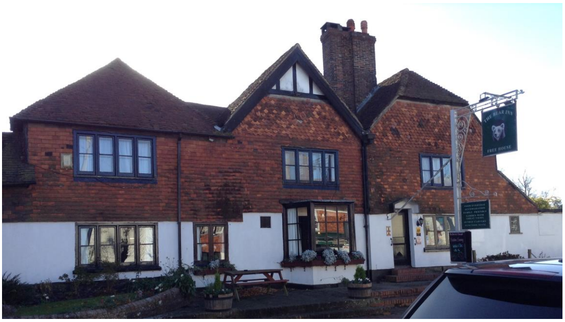
The Bear public house, Burwash

The High Street features several Medieval hall houses which have been subdivided into smaller properties over the centuries. The warped roof lines and eccentric wall angles testify to their age and appeal.