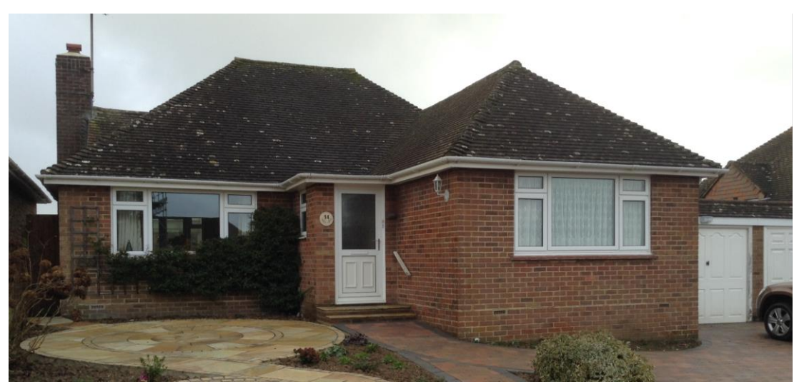
Bungalow in Rother View

The Rother View cul de sac, to the east, was constructed in 1961, offering the kind of plain, brick-fronted bungalows which were popular at the time but which had little of the appeal of the ancient high street.