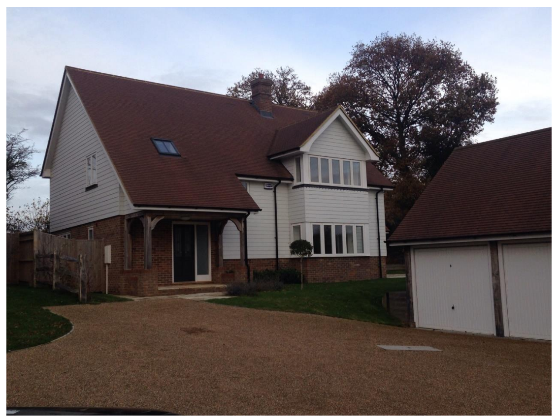
New development, Burwash Weald