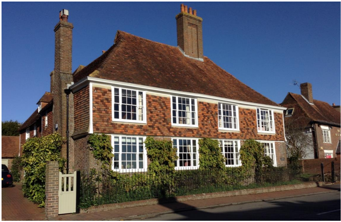
Burghurst, Burwash High Street

People have probably lived in this area for over 1,000 years. Local historians believe a wooden Saxon church may have stood on the site of the current St Bartholomew's church in Burwash village. By Roman times, the current parish was on Route IV from Hurst Green to Heathfield, and there is evidence of iron works nearby. The oldest building in Burwash village is St Bartholomew's church and parts of the Norman original (1090) can be seen today. The current appearance of Burwash High Street dates to the 18th Century when the rows of 15th and 16th Century cottages were upgraded and tile hung by the prosperous Georgians. Some larger houses were also built at this time including Rampyndene, Mount House, Burghurst and Denes House.