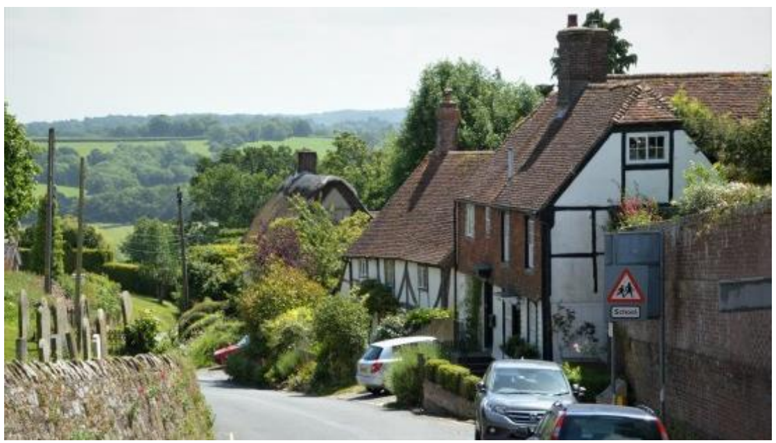
School Hill, Burwash

School Hill is a pretty, meandering lane running south from the War Memorial towards the Dudwell valley. Its mixture of traditional cottages and sympathetically-designed newer homes – all backed by open fields – makes it one of the most distinctive areas of the parish.