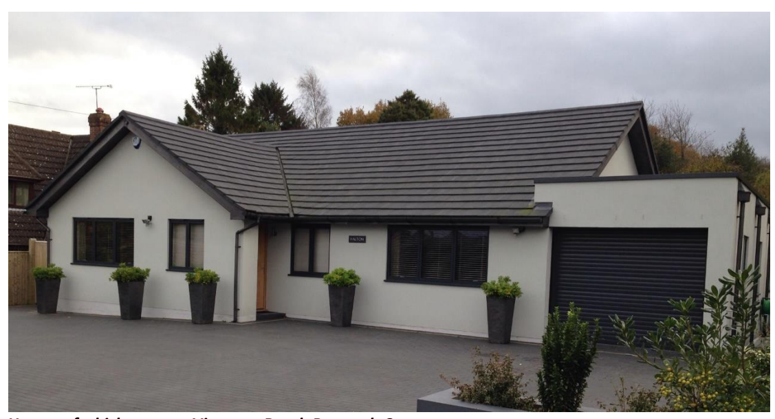
Home refurbishment on Vicarage Road, Burwash Common