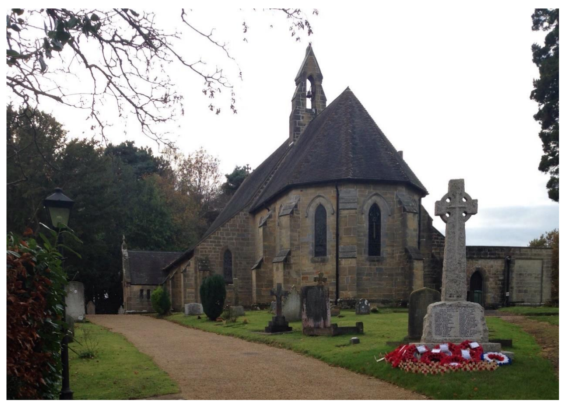
St. Phillip's Church, Burwash Weald, built 1867