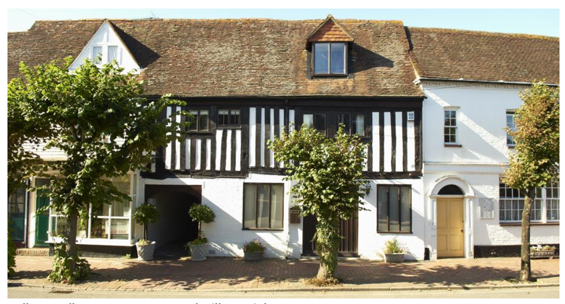
Pelham Hall Guest House, Burwash village High Street

The parish of Burwash is an historic and vibrant rural community with a record of occupation going back over 1,000 years. The parish – made up of the three small villages of Burwash, Burwash Common and Burwash Weald and the surrounding area of open countryside – is located in an Area of Outstanding Natural Beauty, with its main settlements straddling a high ridge running through the High Weald of Sussex and Kent. Beyond the villages, the landscape is an exquisite patchwork of woods and fields, pasture and country pathways, dotted with houses and farms. Many properties enjoy wide vistas or extensive views, some as far as the South Downs National Park to the south. Scores of houses in the area date from medieval times and many are listed. The population is about 2,500. The parish is widely regarded as one of the prettiest in East Sussex.